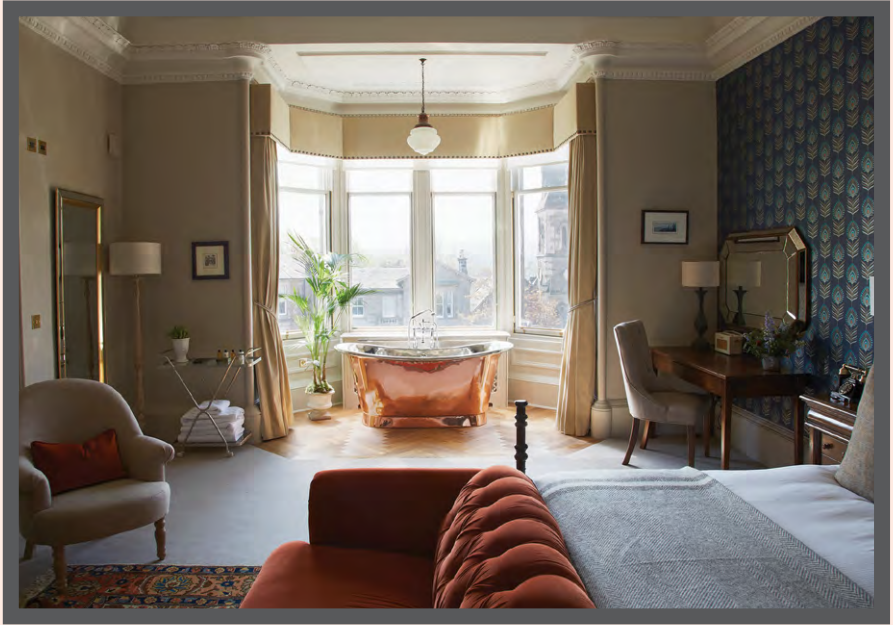
The Roseate Suite