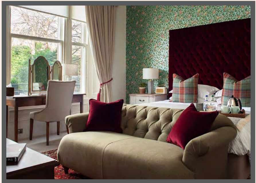
House Junior Suite